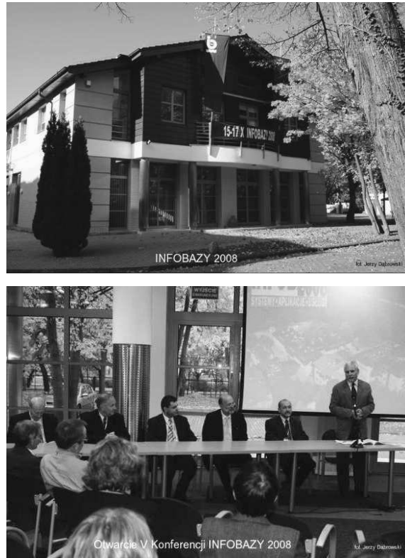
Figure 3. The head office of the Institute of Oceanology, a co-organizer of the INFOBAZY conference in 2008

Managing, processing, maintaining and making these data available to the public has always been a priority for the Institute. This was reflected in the addresses at the previous conferences that the Institute co-organized.