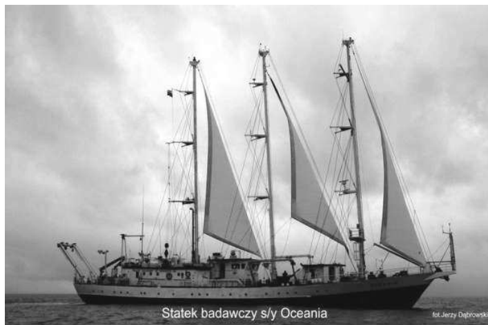
Figure 2. The research vessel Oceania

This diverse and multidisciplinary subject matter requires a wide range of research platforms (such as the Institute's own vessel Oceania , other research vessels, moorings – long-term measuring buoys, seashore measurements, measurement laboratories) and diverse measuring (meteorological, optical, hydrodynamic, acoustic, chemical, etc. ) equipment.