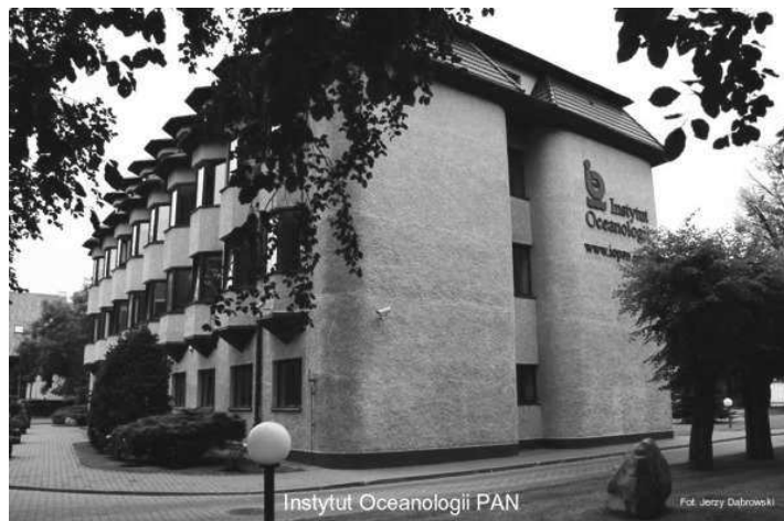
Figure 1. The head office of IO PAN in Sopot

The mission of the Institute is to carry out basic research on marine environment and to broaden the knowledge of its phenomena and processes. This mission has been performed by the Institute for 50 years.